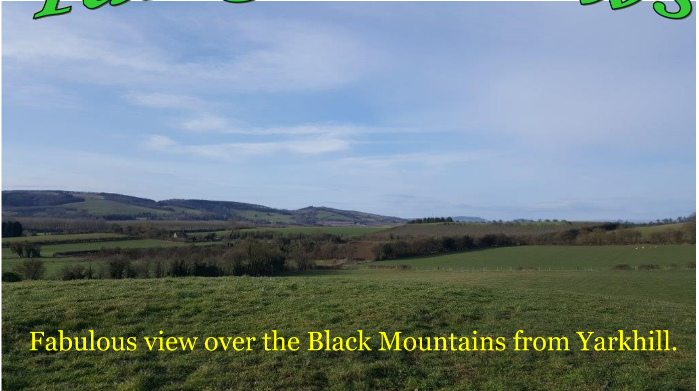
Fabulous view over the Black Mountains from Yarkhill.

As you know, during these difficult times the Newsletter has been emailed to all those people who have given permission for their email address to be used. This will continue to be the case until such time as it is considered safe for the newsletter to be hand delivered once again. If you know someone who specifically wants a paper copy please let me know. There will be several copies in the Village Hall and Church entrances.